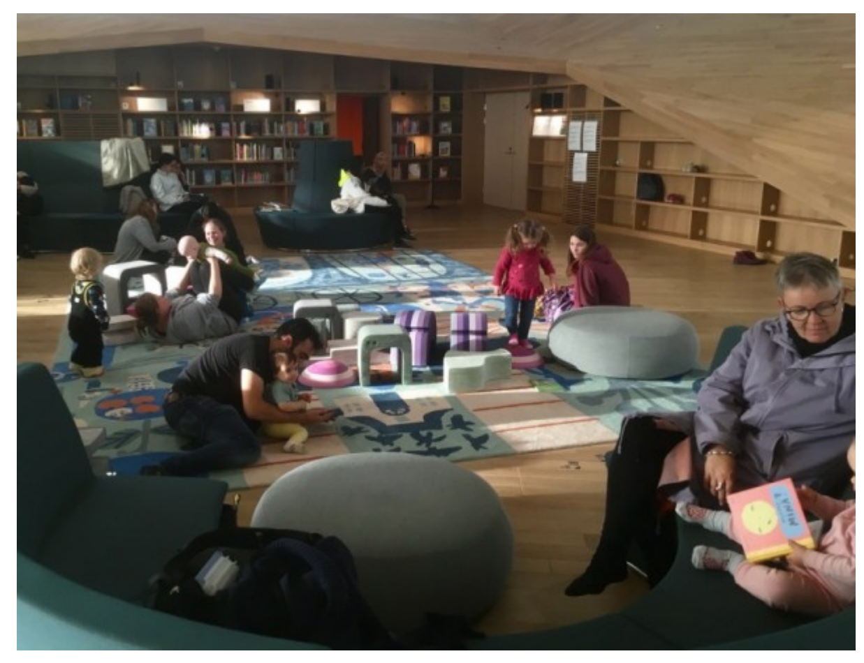
Parents and Children play and reading area of the Oodi Library